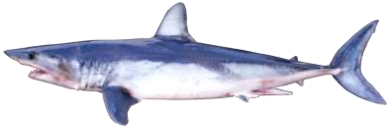
Shortfin Mako Shark ( Isurus oxyrinchus )

Bangladesh, Benin, Bhutan, Brazil, Burkina Faso, Cabo Verde, Chad, Côte d'Ivoire, Dominican Republic, Egypt, European Union, Gabon, Gambia, Jordan, Lebanon, Liberia, Maldives, Mali, Mexico, Nepal, Niger, Nigeria, Palau, Samoa, Senegal, Sri Lanka, Sudan and Togo